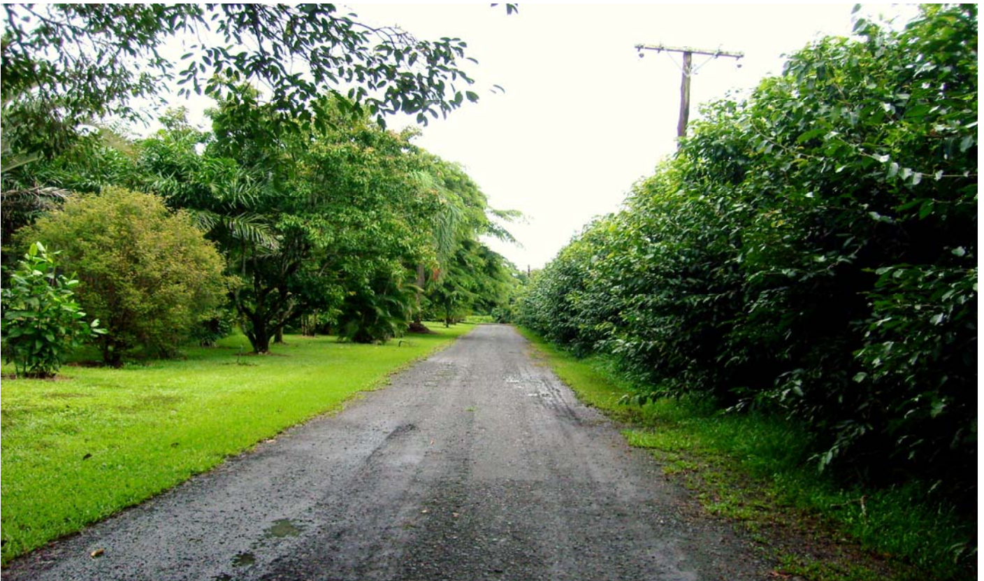
Entrance to Tropical Blooms

We had introduced a completely new range of exotic flowers to the florists and public of Australia and we had a three year head start over most of our potential competition.