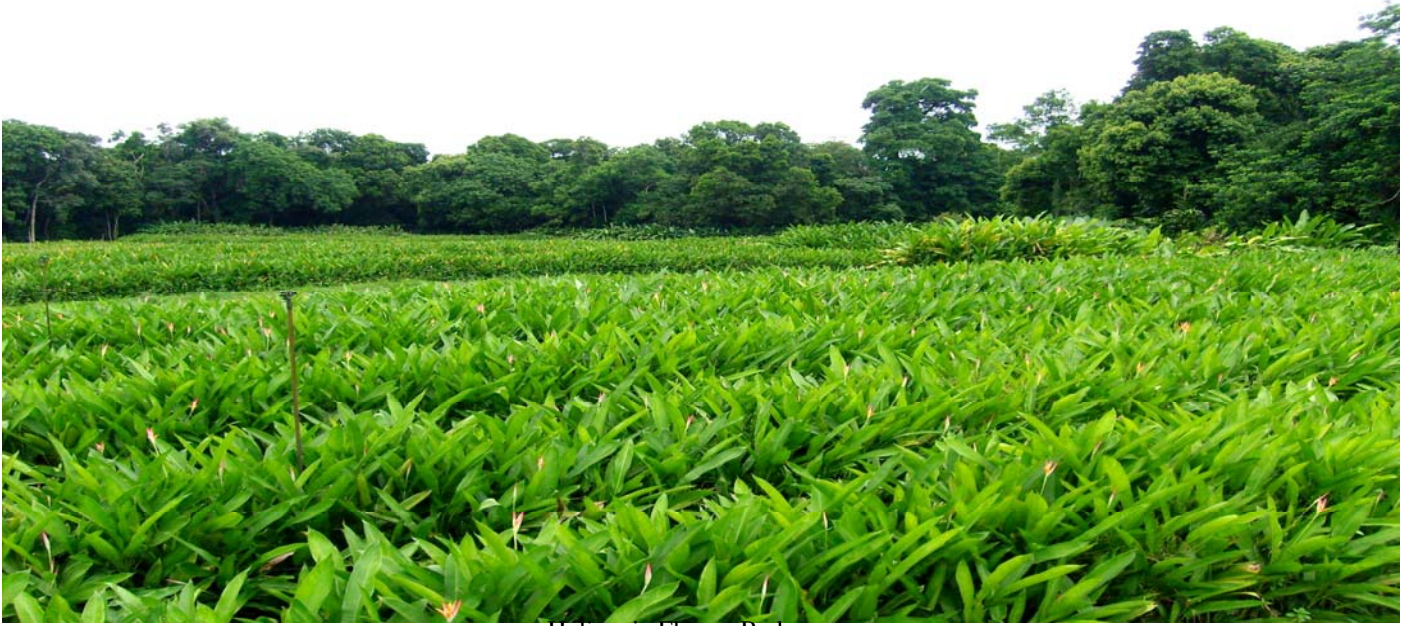
Heliconia Flower Beds