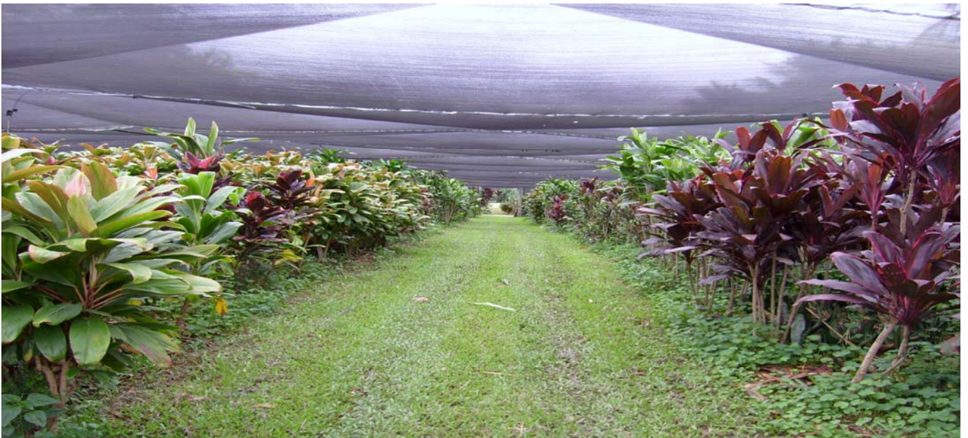
Cordyline Foliage Plants