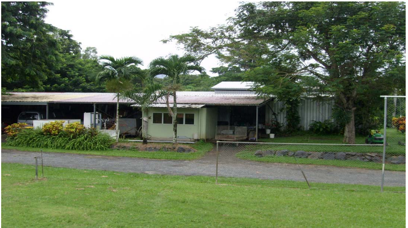
Packing and Machinery Shed

Over the years Tropical Blooms has continued to be the leading grower supplying directly to florists all over Australia. Very rarely can a single company claim to have been the founder of a new industry. Tropical Blooms can make this claim. It is the oldest established professional tropical flower business in Australia and was instrumental in paving the way for commercial imports of these exotic plants. Heliconias were unheard of except to a handful of collectors before we started marketing them to the floral industry.