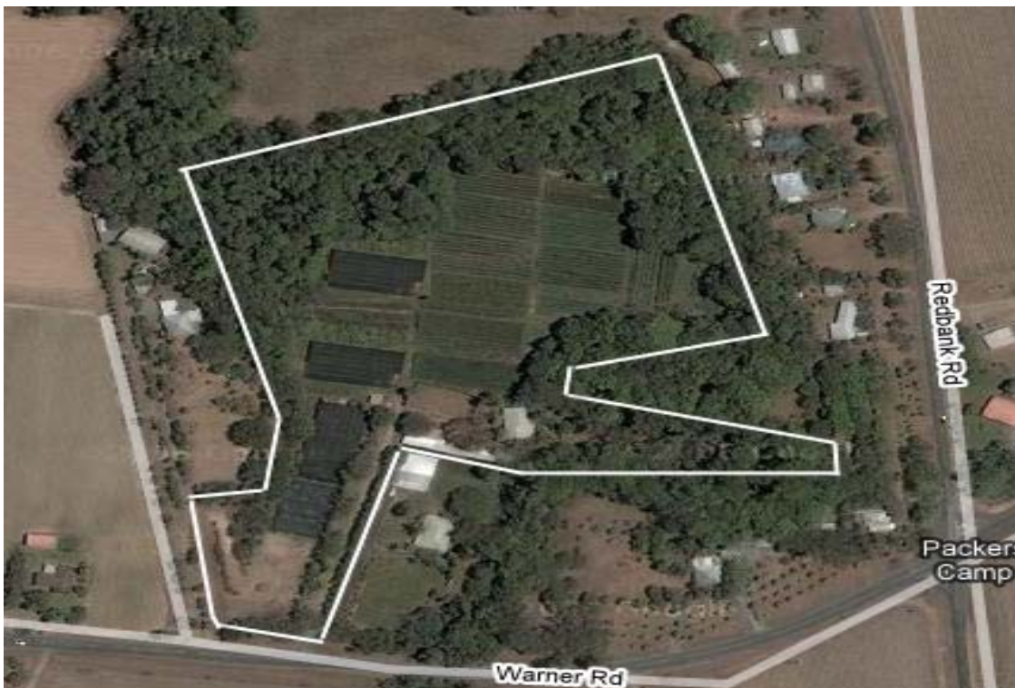
Tropical Blooms Farm

Flora and fauna on the farm are diverse. We have barramundi and other fish in the creek and many species of small animals including the rare sugar glider possum. Green rainforest frogs are thriving and a huge number of birds flourish in the large trees. The Cairns Ornithological society identified over 50 species of birds in one visit to our farm. Many exotic trees such as Cedar, Silky Oak and Milky Pine still grow along the creek. We use almost no poisonous sprays in growing our flowers in an effort to maintain a clean environment around the farm.