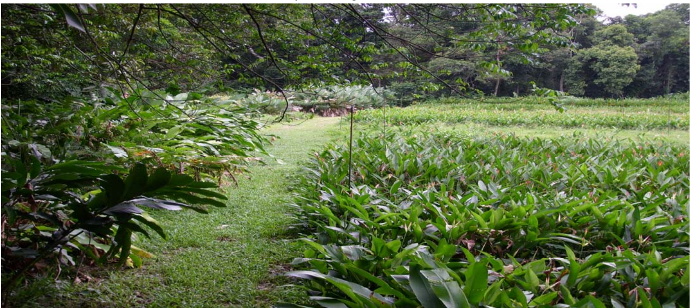
Creek line Boundary